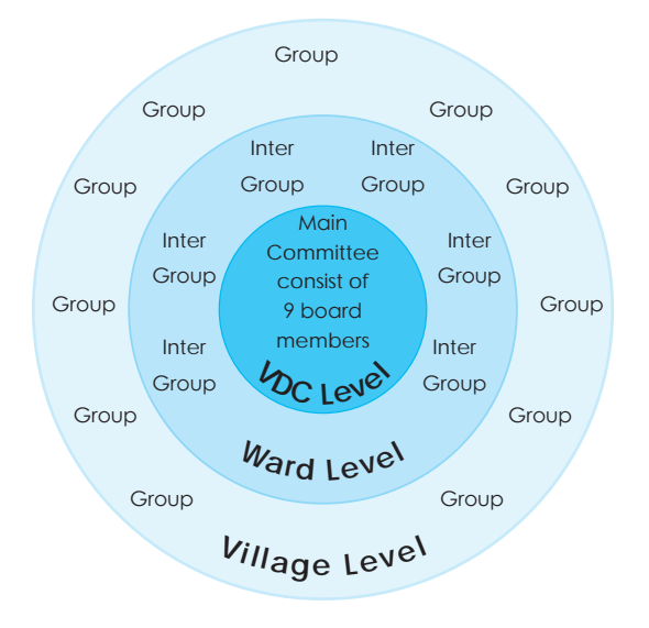
Figure 1: The three-tiered organizational structure of SFCL Salang

The services of the SFCL include both financial and non-financial services. It provides range of financial services comprising varieties of savings products, microfinance and microenterprises loans, livestock insurance, life insurance and remittance. Non-financial services include community development programs, milk collection, vegetable collection and marketing, agricultural inputs, community forestry, promotion of tourism (home-stay), skill training (goat raising, house wiring, maintenance of TV and mobile, organic farming and others) and literacy programs (further detail later).