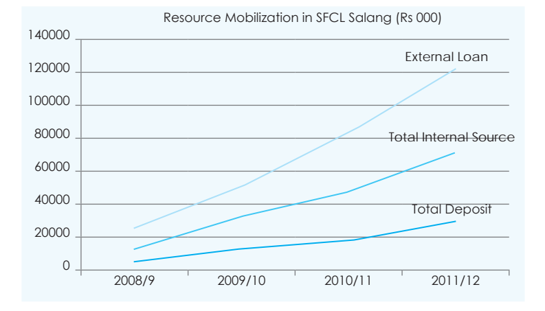
Figure 3: Trend of Resource Mobilization

20. Deposit is one of the major sources of internal resource mobilization. Currently it accounts to about three fourth of the total internal source (Figure 3). The deposit has grown almost five times in the last four years. The growth in deposit is 68%, annually (Table 3). Total internal source is increasing at the rate of 55% a year. Rapid mobilization deposit and contribution by external loan in increasing the profit has contributed in increasing internal sources at faster rate.