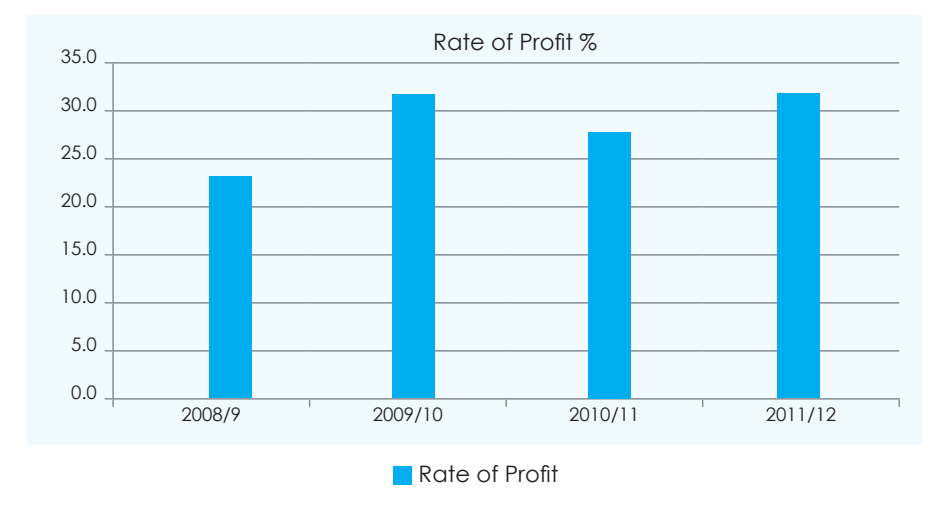
Figure 2: Profit Growth Trend

15. The profit rate lies within 28 % to 32 % over the last four years (Fig 2). The co-op has been providing a healthy dividend 12-15% per annum. With adequate surplus, it has been able to allocate adequate fund in statutory reserve, loan loss provisioning and other fund. Though the co-op could distribute dividend of 15%, it seems to have given emphasis in other support activities and fund creations, which ultimately strengthens the portfolio earning of the co-op.